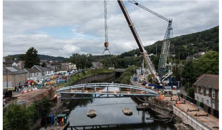
Roy Edwards award 2024

Castle Inn demolition and reconstruction