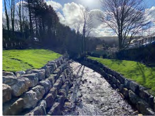
Designed in Wales Award 2024 Derwent Reservoir scour hole repair scheme