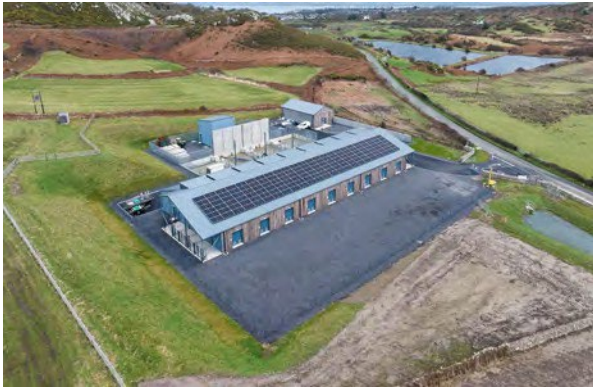
Alun Griffiths award 2024 Morlais Tidal Energy scheme