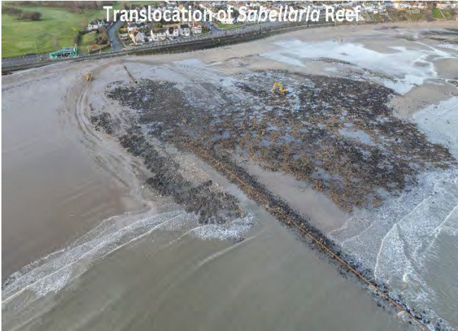
Severnside award for diversity 2024 Penrhyn Bay Coastal Defence Scheme